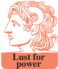
Lust for power